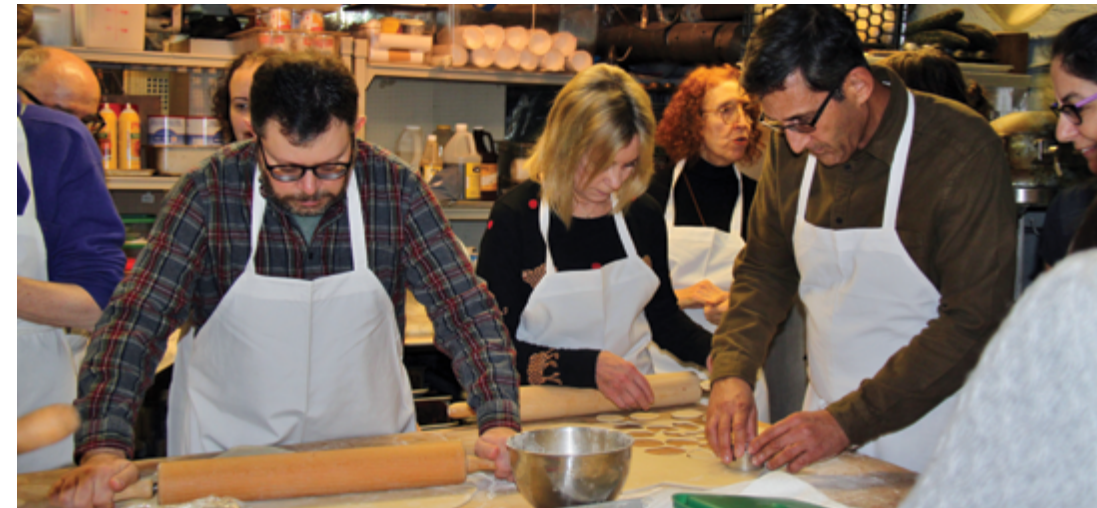
GVSHP members learn how to make pierogis at Veselka

By far the majority of GVSHP's membership support continues to come from local residents. But we also receive support from across the city, country, and world, from those who believe in preserving the special character and legacy of the Village, East Village, and NoHo, and in historic preservation. New members came to GVSHP from a variety of sources over the past year, including programs, continuing education, advocacy, our Annual Awards and House Tour, interaction with our website and online resources, social media, and newsletters.