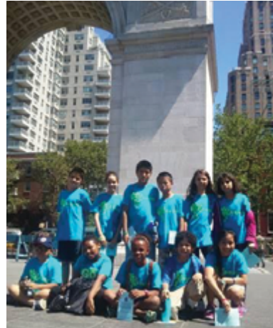
Our children’s education program in Washington Square

GVSHP secured several grants which, along with membership support, allowed us to continue to offer our Children’s Education program to any school in New York City regardless of need or ability to pay. Throughout the 2017-2018 School year, our program served nearly 1,300 students in fifty-seven classes in schools throughout Manhattan, Brooklyn, and the Bronx. About 84% of the classes received need-based scholarships allowing them to participate in the three-session program for free, while the remainder paid a small administrative fee.