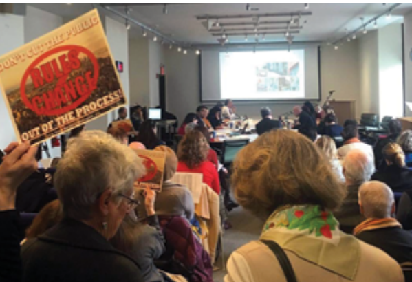
Protesting the proposed LPC rules changes

Citywide, we led the successful campaign to turn back a proposal by the Landmarks Preservation Commission (LPC) to cut the public out of an important part of the landmarks review process. The LPC had planned to change its rules so that more applications for changes to landmarked buildings, including for certain types of rooftop and rear yard additions, could sidestep the public review and approval process, and be decided behind closed doors by LPC staff. This would have meant the public would not know about, be able to see, or be able to comment upon these applications, as they do now. After significant pushback led by GVSHP, the plan was withdrawn and most of the most egregious elements removed.