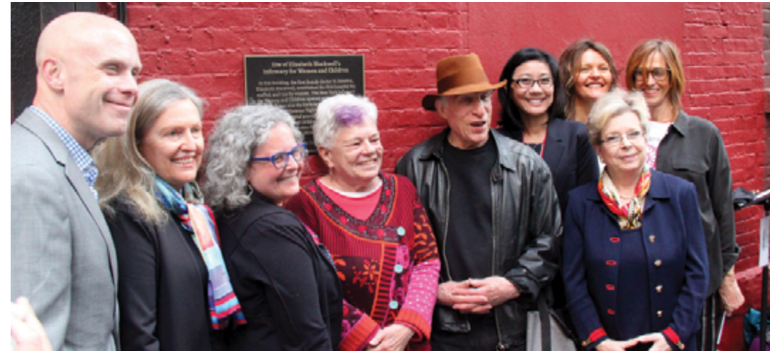
Unveiling of our Elizabeth Blackwell plaque

GVSH had an exceptionally busy programming year, with over seventy public programs attended by over 6,100 people. Almost all of our programs were free and, with the exception of our members-only events, open to the public. These ranged from lectures on Greek Revival architecture to the life and legacy of Lou Reed; film screenings on Yiddish Second Avenue to a salute to women poets of the Village at the Cherry Lane Theater; a Fiftieth Anniversary celebration of the Fillmore East to walking tours of Bleeker Street, West 14th Street, and West Village Holiday lights.