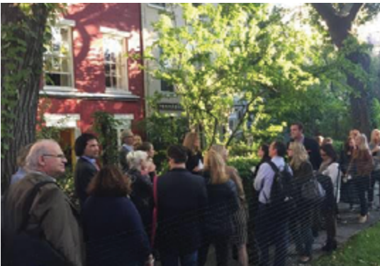
Our Continuing Education program on a tour of MacDougal Sullivan Gardens

or NoHo’s retail or commercial treasures. Local businesses are the backbone of our neighborhoods, and many find themselves in an increasingly tough, competitive environment of rising rents and proliferating chain stores. We invite the public to nominate their favorite businesses for consideration for our Business of the Month, and hope to increase support for and patronage of independent stores that provide vital services or unique amenities in our neighborhoods. Hundreds of individuals have submitted nominations, and our Business of the Month selections have been seen by thousands of viewers. This past year we celebrated theaters, hardware stores, food shops, music stores, bathhouses, tea shops, and florists, among others—all independently-owned, and providing a unique service or product.