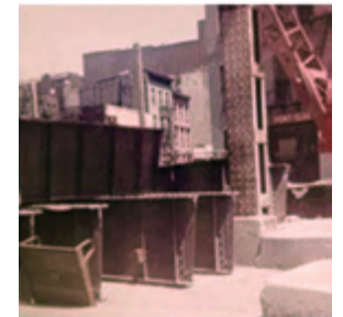
Additions to our Historic Image Archive