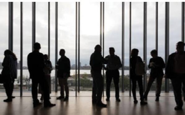
The reception afforded a stunning view of the Hudson River

Please see the index in back for a full list of donors to the event.