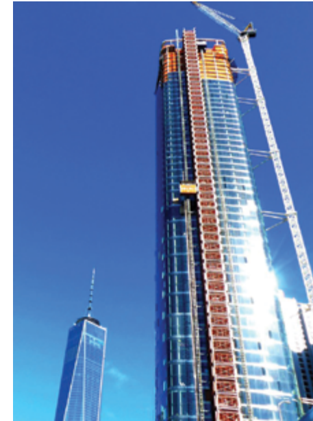
A change in state law could have allowed the city to 'supersize' buildings in residential neighborhoods

GVSHP reviewed nearly one hundred applications for changes to landmarked buildings that require public approval in our neighborhood over the past year. We continued to monitor on a daily basis all 6,500 building lots in our neighborhood for demolition, alteration, and new construction permit applications, as well as 3,500 landmarked building sites for applications for approval for changes.