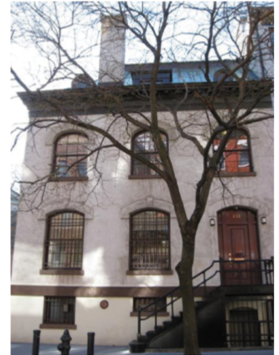
GVSHP’s home in the Neighborhood Preservation Center, located in the Ernest Flagg Rectory of St. Mark’s Church, 232 East 11th Street, in the St. Mark’s Historic District.