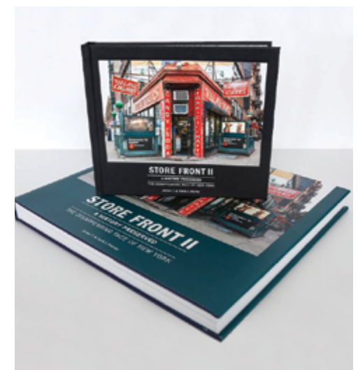
Book talk on disappearing storefronts

GVSH's programming educates the public about historic preservation, and provides new insights and perspectives on the unique architectural and cultural heritage of Greenwich Village, the East Village, and NoHo.