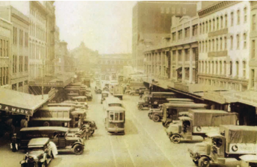
From our tour of West 14th Street