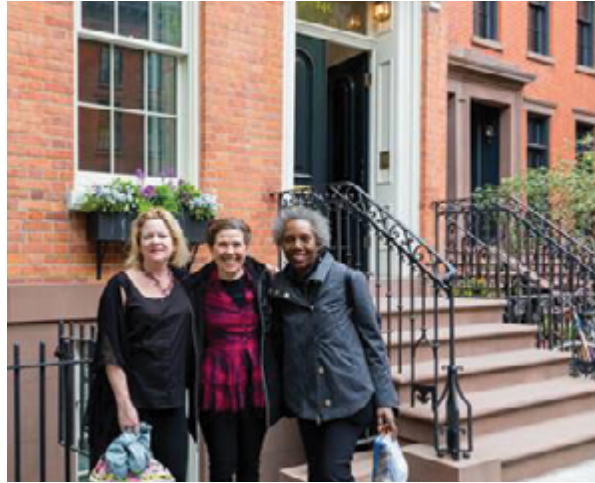
Tourgoers enjoyed exclusive access to an incredible array of houses;

The tour was made possible by the hard work of more than one hundred thirty volunteers, more than a dozen hard-working Benefit Committee members, and of course the incredibly generous