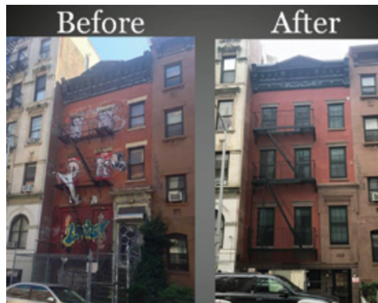
Bea Arthur residence